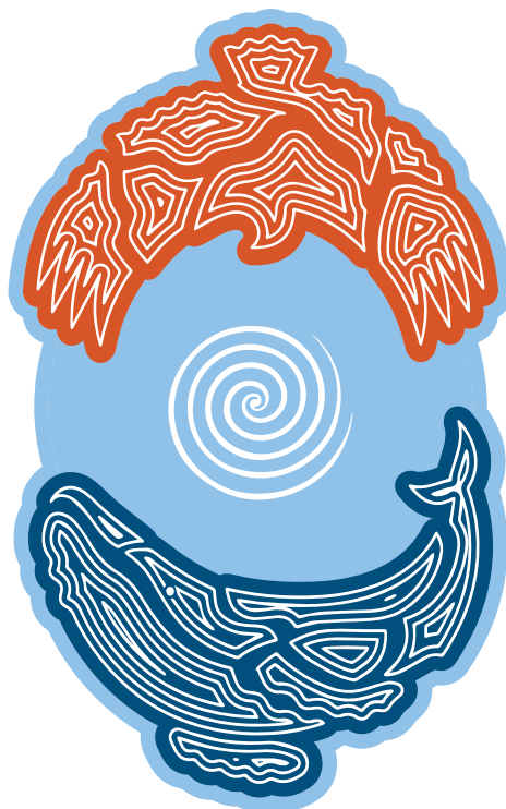
'2024 Indigenous Nationals'