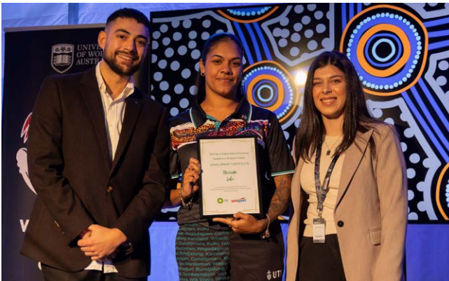
Blossom Lake University of Technology Sydney