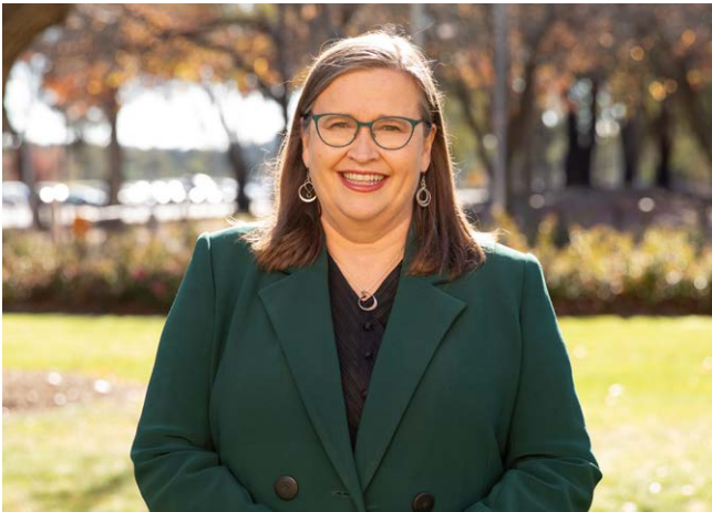
Kate Jenkins AO

Chair of the Australian Sports Commission